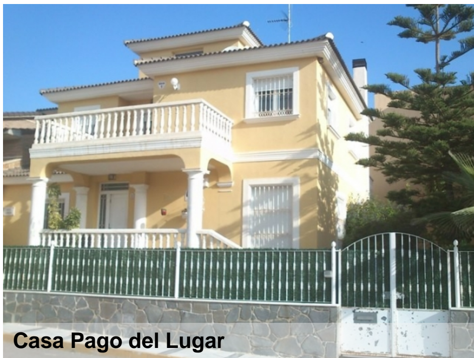
Casa Pago del Lugar