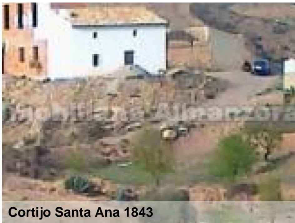
Cortijo Santa Ana 1843