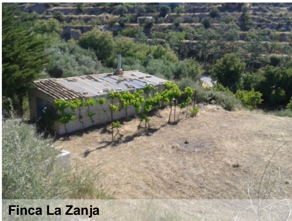
Finca La Zanja