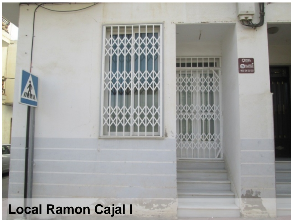
Local Ramon Cajal I