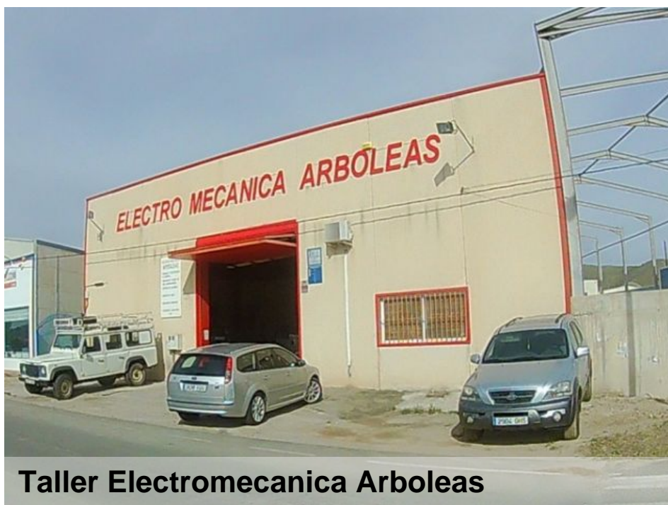
Taller Electromecanica Arboleas