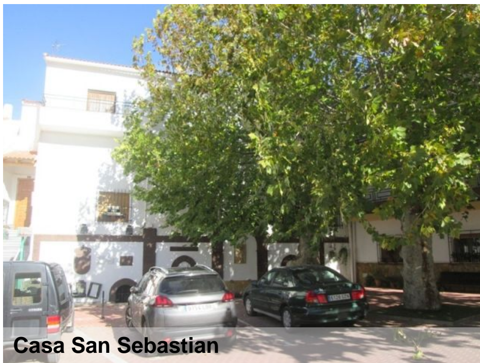
Casa San Sebastian