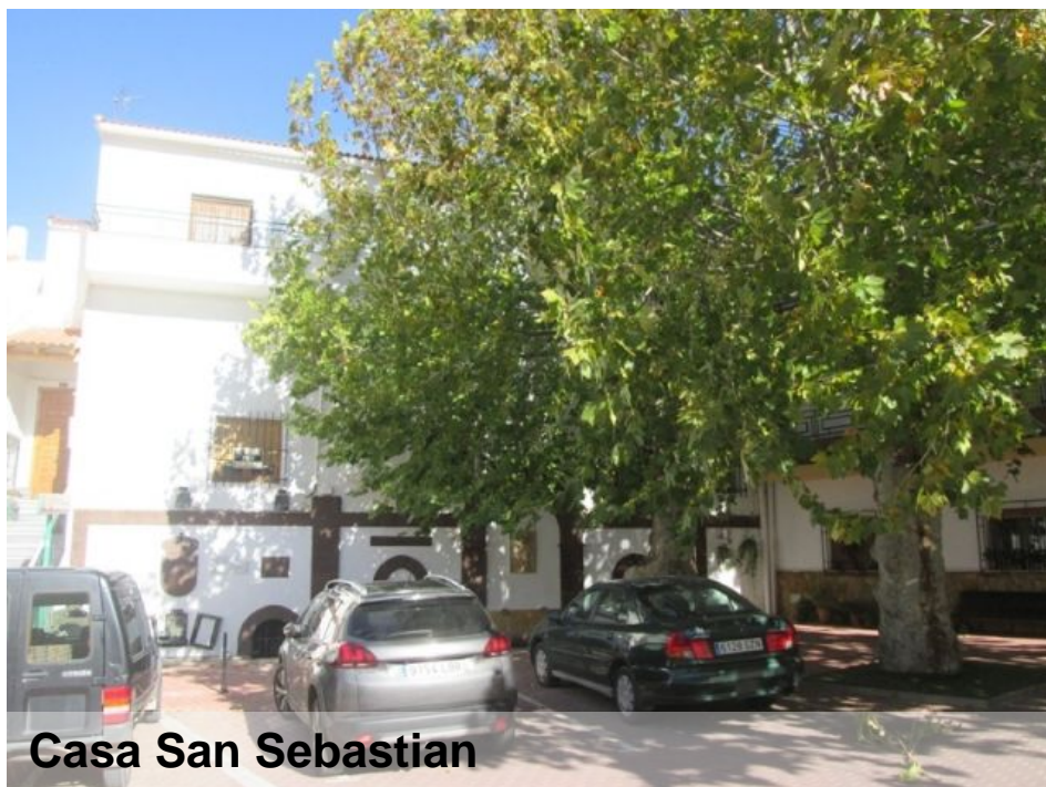
Casa San Sebastian