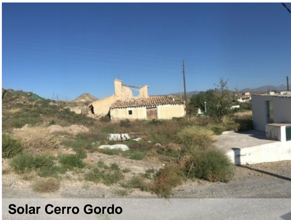
Solar Cerro Gordo