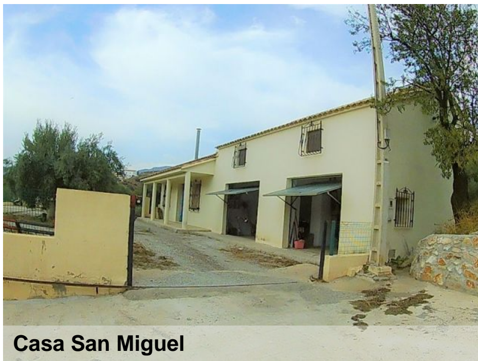
Casa San Miguel