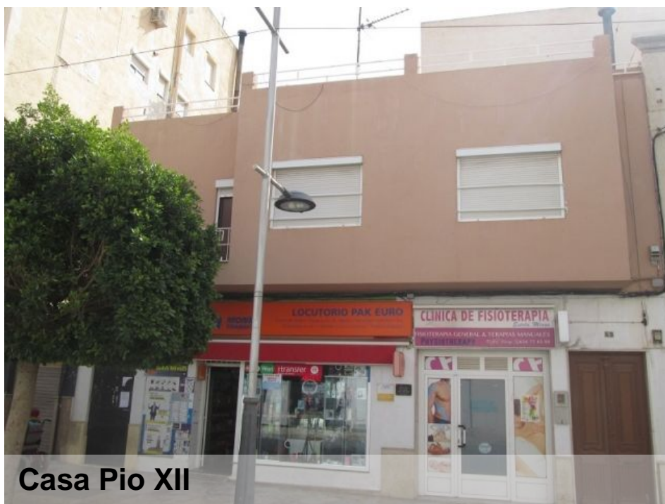
Casa Pio XII