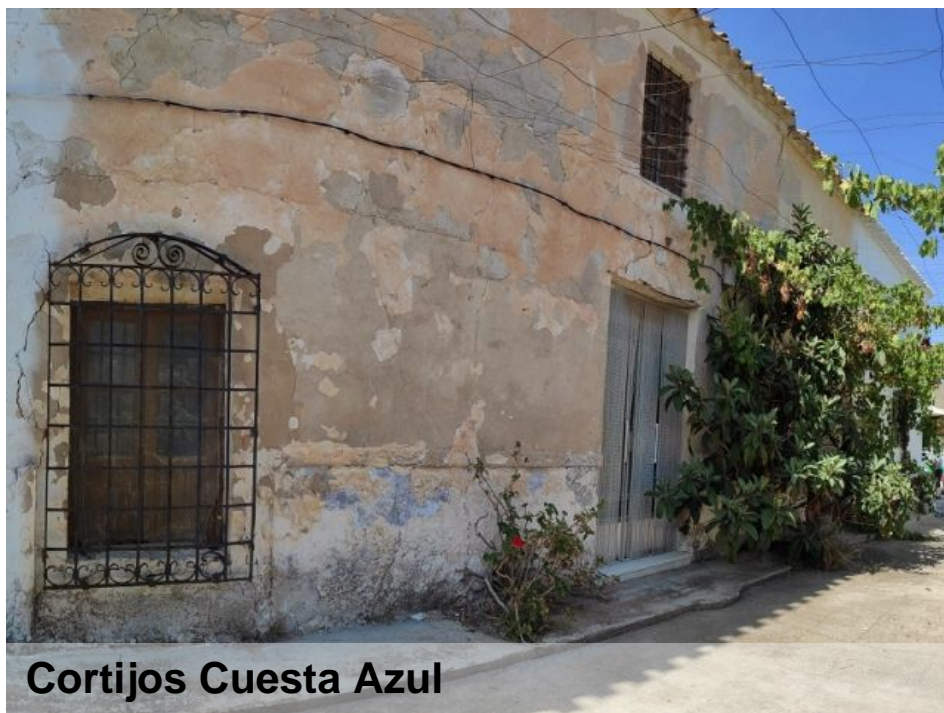
Cortijos Cuesta Azul