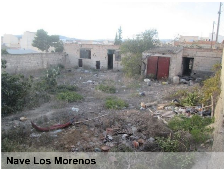
Nave Los Morenos