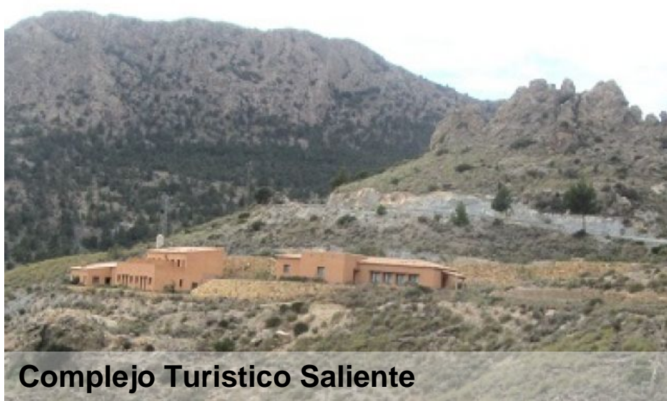
Complejo Turístico Saliente