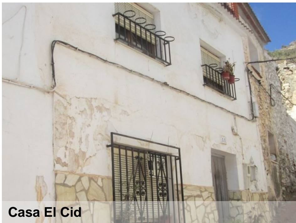
Casa El Cid