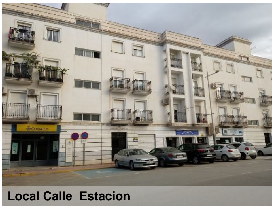
Local Calle Estacion