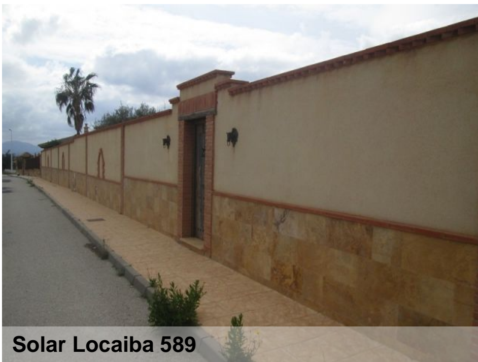
Solar Locaiba 589